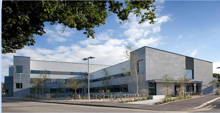
School of Psychology building on the main campus

We're really looking forward to meeting you all and being a part of your important first-year journey at University of Galway. We want to make sure that your experience of studying Psychology is rich and rewarding, and we also realise that your physical and psychological wellbeing is extremely important; please know that we're available to support you throughout the year, so keep in touch with us, whether you have a question about the course or you're feeling overwhelmed (we've met students with so many different challenges and circumstances over the years, so you're not going to shock or bother us in any way).